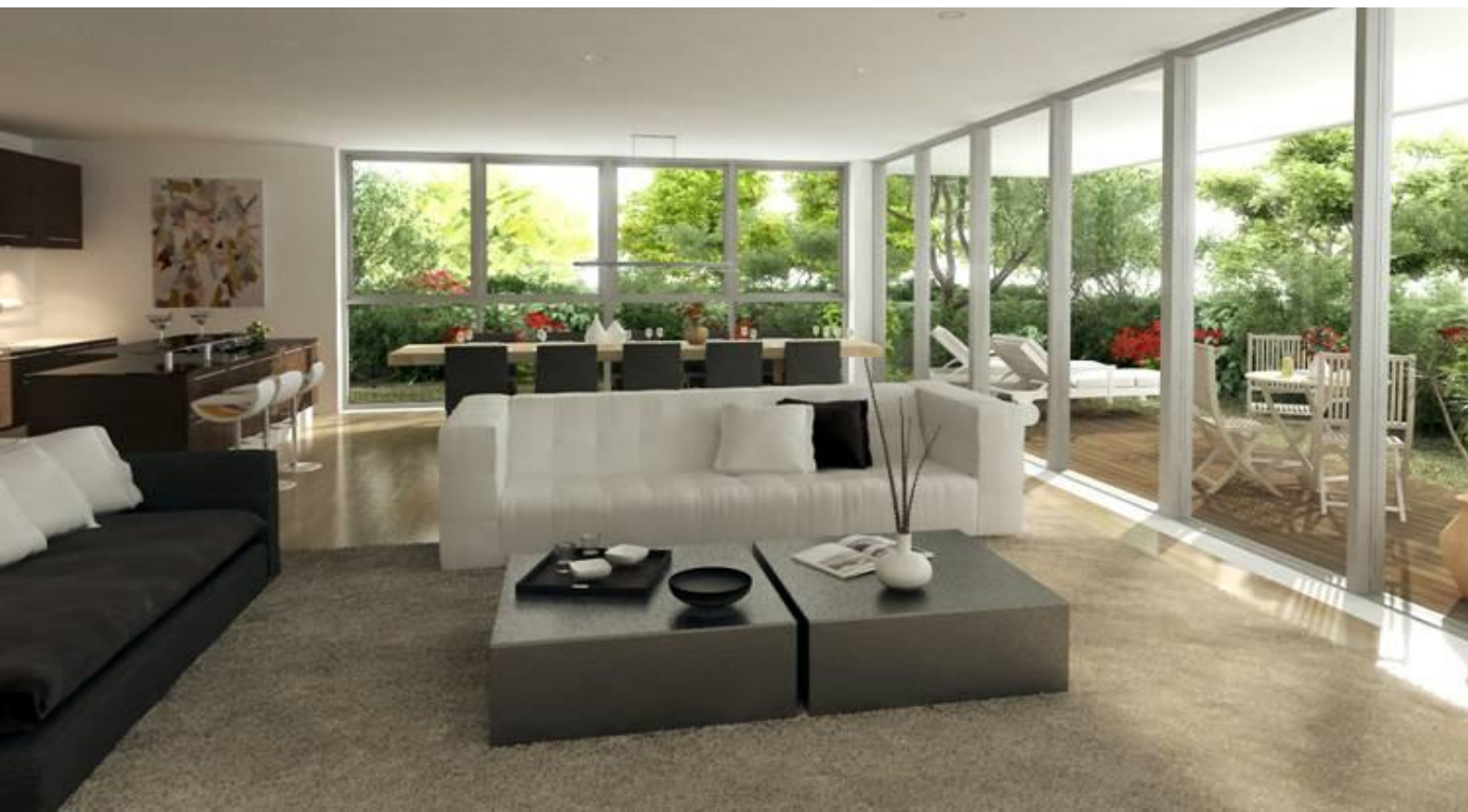
Ground floor apartment